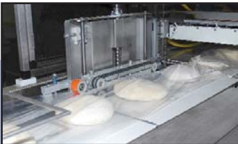
TS37 Wrapping Pizza Dough