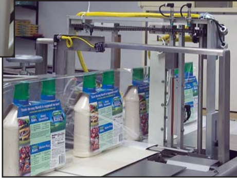
Vertical Sealing System