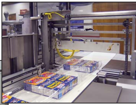
Horizontal Sealing System