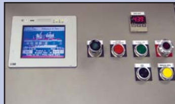
User-Friendly Operator Controls