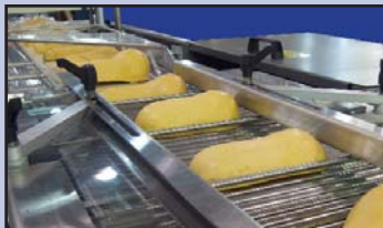
TS37 Wrapping Squash