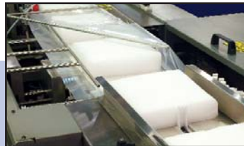
TS37 Wrapping Dry Ice