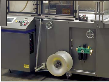
Scrap Removal System Compacts Excess Film Scraps