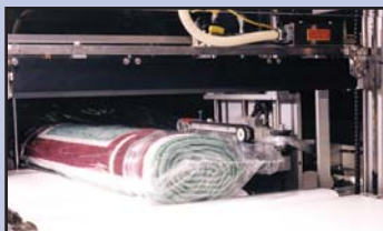
Wrapping Roll Goods-Trim Seal Unit