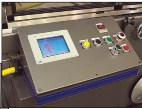
User-Friendly Operator Interface