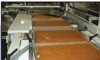
Wrapping Trays of Cake Sheets

Maximum package dimensions cannot occur together