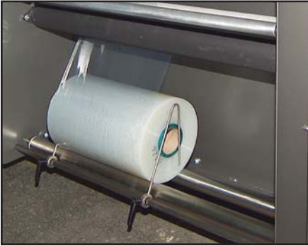
Side Mounted Film Cradle for Easy Film Loading